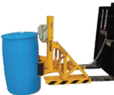
Signle Drum Picker