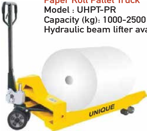
Paper Roll Pallet Truck Model : UHPT-PR Capacity (kg): 1000-2500 Hydraulic beam lifter available