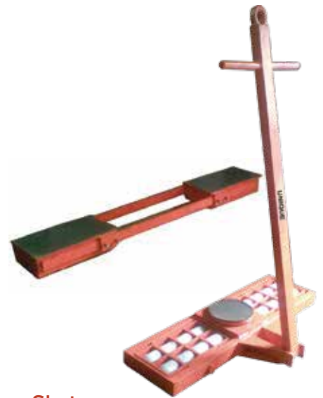
Skates Model : USH Capacity (kg): 4000-20000