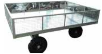
Cage Platform Trolley Model : UPT-C Capacity (kg): 500-5000