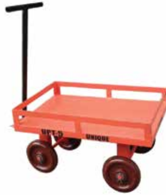
Light Duty Platform Trolley Model : UPT-L Capacity (kg): 500-2000