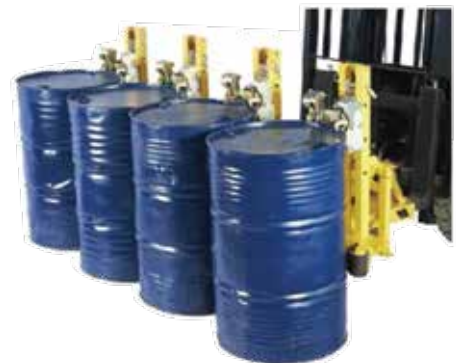
Four Drum Picker