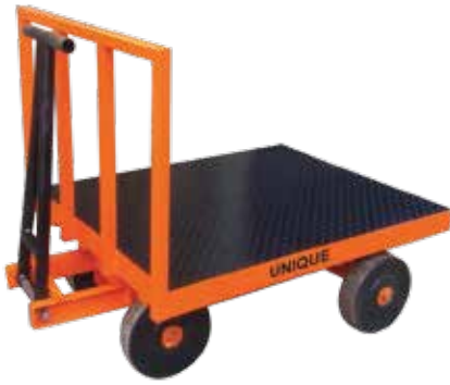
Heavy Duty Platform Trolley Model : UPT-H Capacity (kg): 2000-5000