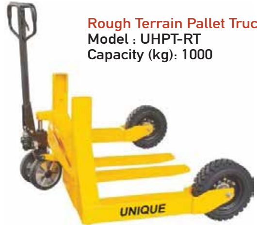
Rough Terrain Pallet Truck Model : UHPT-RT Capacity (kg): 1000