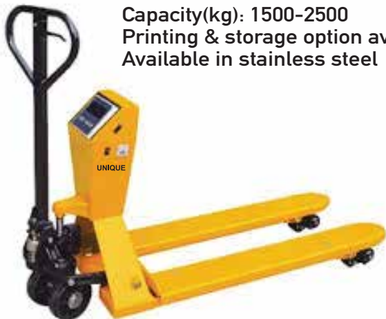
Weighing Scale Pallet Truck Model : UHPT-WS Capacity(kg): 1500-2500 Printing & storage option available Available in stainless steel