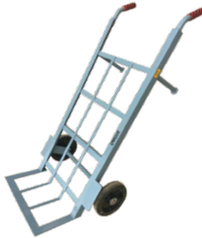
Luggage Trolley Model : ULT Capacity (kg): 200