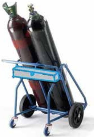
Single & Dual Gas Cylinder Trolley Model : UGC Capacity (kg): 300 Avalable With Tool Box