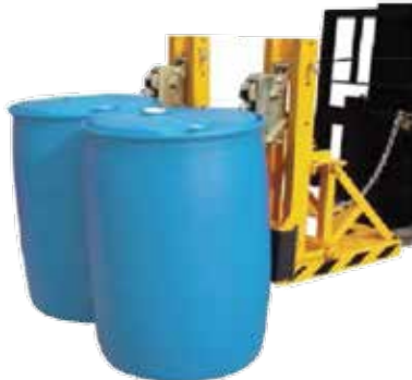
Double Drum Picker