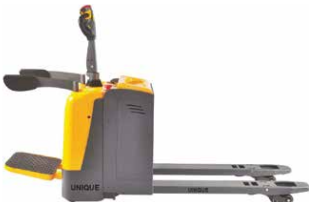
Battery Operated Pallet Truck Model : UBOPT Capacity (kg): 1500-2000 Lift (mm): 200 EPS optional AC