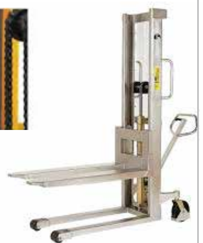
SS Manual Stacker