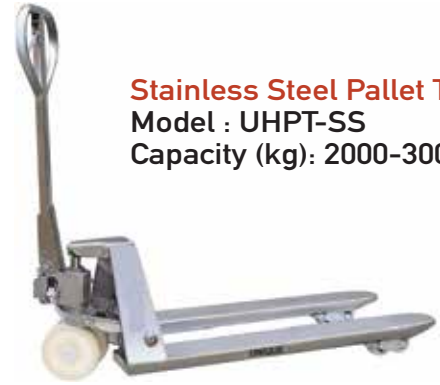
Stainless Steel Pallet Truck Model : UHPT-SS Capacity (kg): 2000-3000