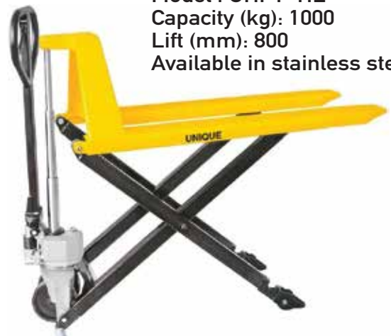
High Lift Pallet truck Model : UHPT- HL Capacity (kg): 1000 Lift (mm): 800 Available in stainless steel