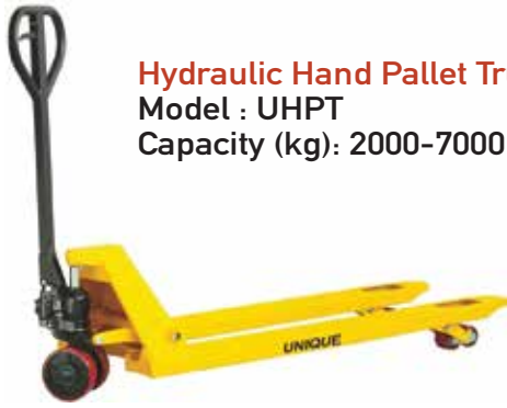
Hydraulic Hand Pallet Truck Model : UHPT Capacity (kg): 2000-7000