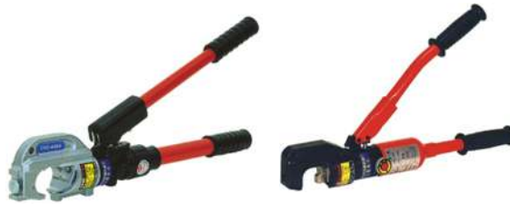
Ti-Tanium CYO-240 (opener type)