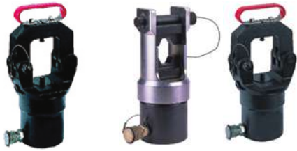
CO-630A CO-630B CO-1000